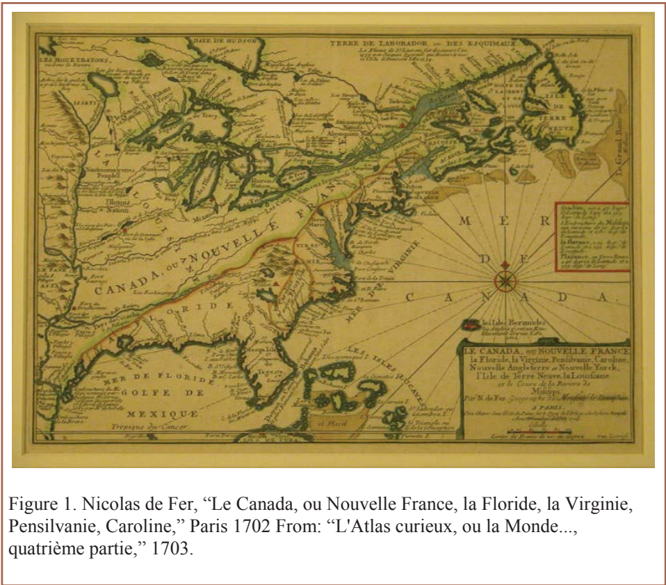
Figure 1. Nicolas de Fer, “Le Canada, ou Nouvelle France, la Floride, la Virginie, Pensilvanie, Caroline,” Paris 1702 From: “L’Atlas curieux, ou la Monde..., quatrième partie,” 1703.