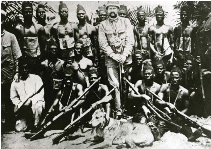
Figure 3. German Lieutenant Steinhausen and native policemen in Cameroon, 1891.

The consolidation of the Aghem and their neighbours into the same administrative unit began with the German colonisation of the area in the late nineteenth century. Germany colonised Cameroon in 1884 after the Germano-Douala treaty. By 1902, they had explored the western grasslands of Cameroon. The Germans recognised Aghem domination over their neighbours and in 1908 established a German military station (district) at the Aghem settlement. Thus, it became the administrative headquarters of the newly created government unit and the point from which the Germans coordinated activities for the entire district. 23