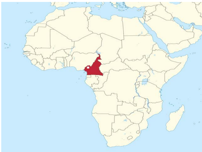
Figure 1. Map illustrating study area in Cameroon. Adapted from the Map of Africa, Google.

The Aghem are in the present day Menchum Division of the North West Region of Cameroon. They are bounded to the north and northwest by the Esu and Weh, to the West by the Kuk, south and southwest by the Beba, Befang, and Esimbi settlements (see figure I and II for the location of the study area).